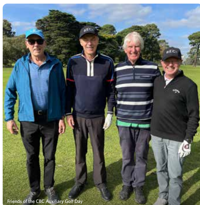
Friends of the CBC Auxiliary Golf Day