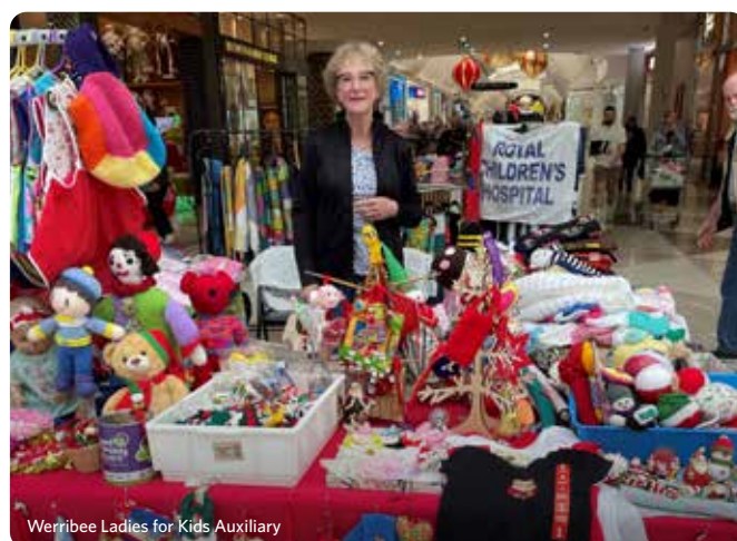
Werribee Ladies for Kids Auxiliary

Werribee Ladies for Kids Auxiliary had a successful year with thanks to markets at the RCH and sausage sizzles at our local Bunnings. We also sold raffle tickets at our local Tigers Club, profited from 'the jar' at Grill'd and held home and knitting group sales.