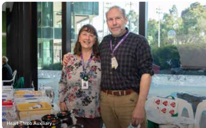
Heart Throb Auxiliary