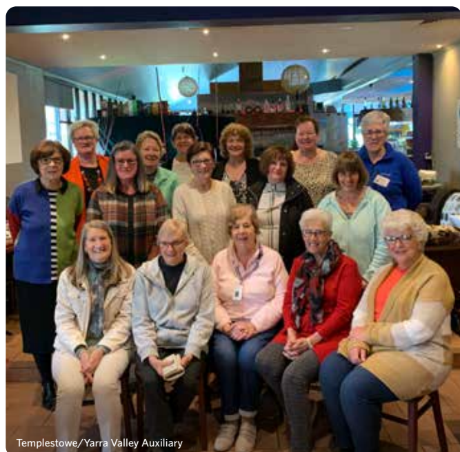
Templestowe/Yarra Valley Auxiliary

Throughout the last year we also had members attend the AGM and Celebratory High Tea at the Sofitel, Combined Auxiliary Meetings, Christmas Party, Living Treasures events, Dame Elisabeth Murdoch Nursing Development Scholarship Luncheon and Paddy's Market.