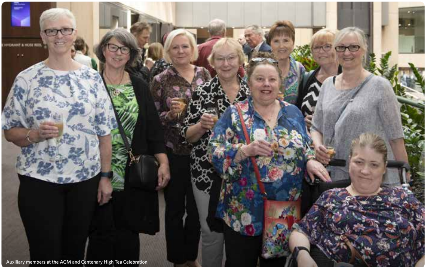
Auxiliary members at the AGM and Centenary High Tea Celebration