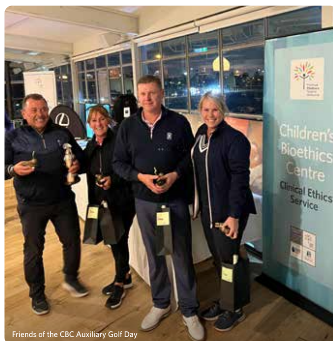
Friends of the CBC Auxiliary Golf Day